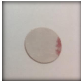
t = 5 sec