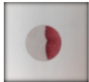
t = 60 sec

1 drop of water placed at edge of ½” diameter circle @ t = 0 sec.